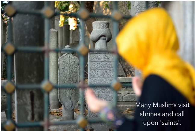
Many Muslims visit shrines and call upon 'saints'.

How many of the commands of Allah and His Messenger (ﷺ) reach us from what we read in the Book of Allah, or in the Sunnah of Allah’s Messenger (ﷺ), what we hear in the Friday khutbahs, or from the admonitions of the scholars and students of knowledge—all of this hear or read—but where is the submission?! Where is the hearing and obeying our Lord and His Messenger (ﷺ)? Where is fulfilment of the mighty rights of Allah and the rights of His final Prophet?