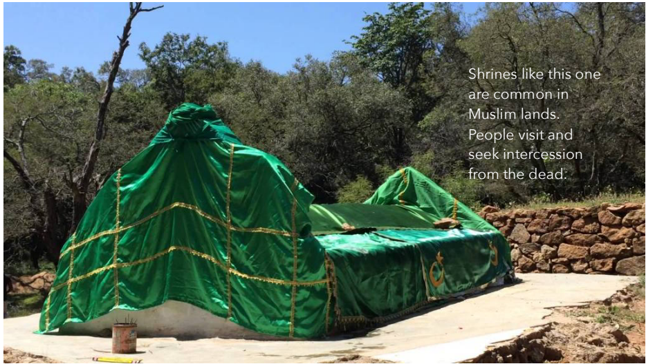
Shrines like this one are common in Muslim lands. People visit and seek intercession from the dead.

their shrines and graves, swearing allegiance and devotion to them, and following the gnostic paths and orders of Sufism.